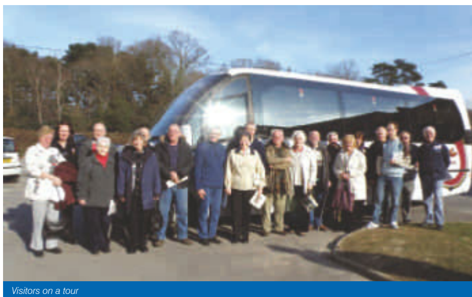
Visitors on a tour

Each tour is open to residents in the SO31 and SO45 postcode areas only . Visitors must be over 16 and up to three people are allowed per household. All visitors must bring personal identification