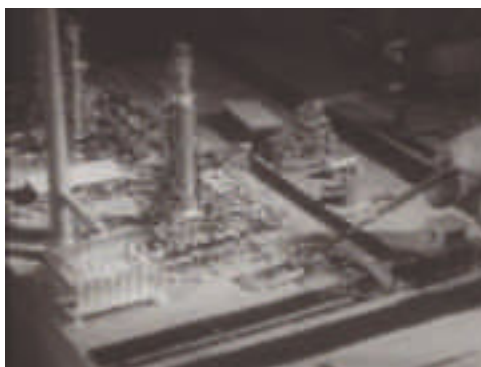
One of the units being hand painted