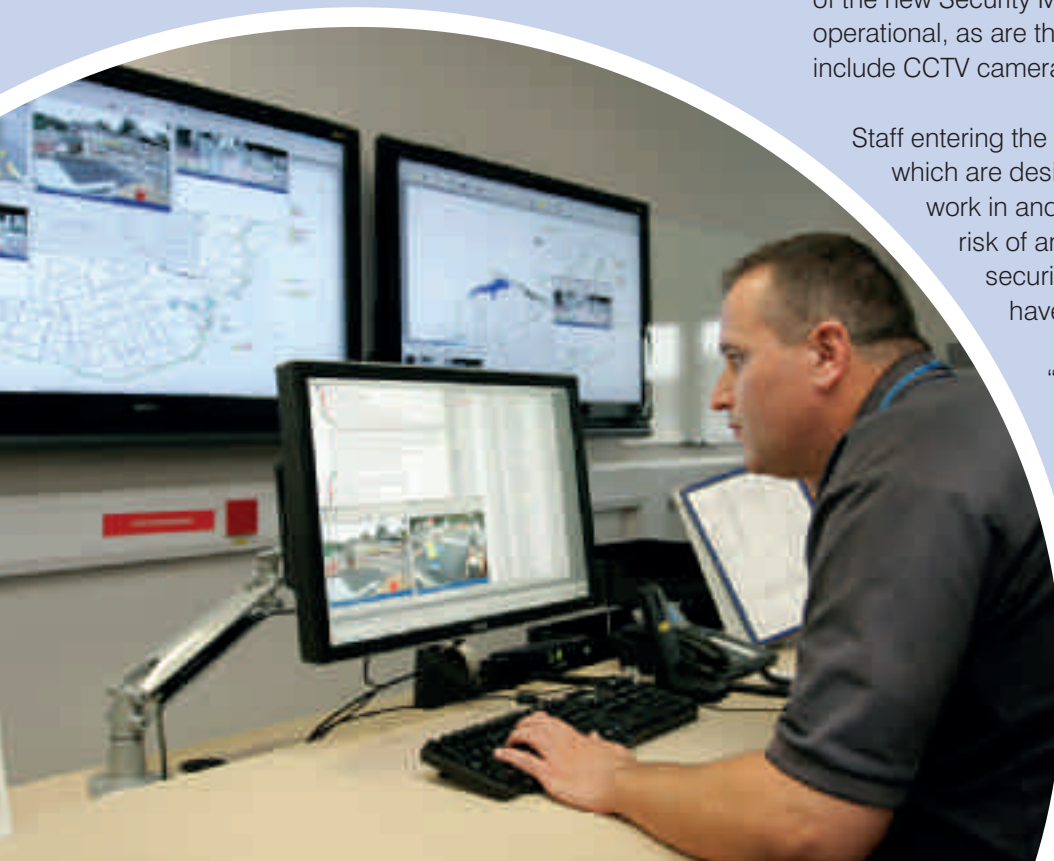
An operator observes CCTV footage in the new Security Monitoring Centre.