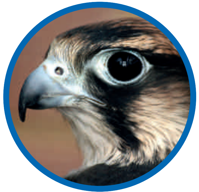
Peregrine Falcon's nest at the refinery attracted by the many pigeons

Many different creatures can be found at the refinery and our Environmental Group is currently collecting information on biodiversity at the site. The salt marsh is a site of special scientific interest (SSSI) and access to the area is minimised to help prevent erosion. It provides a much needed ground for fish nurseries and an area