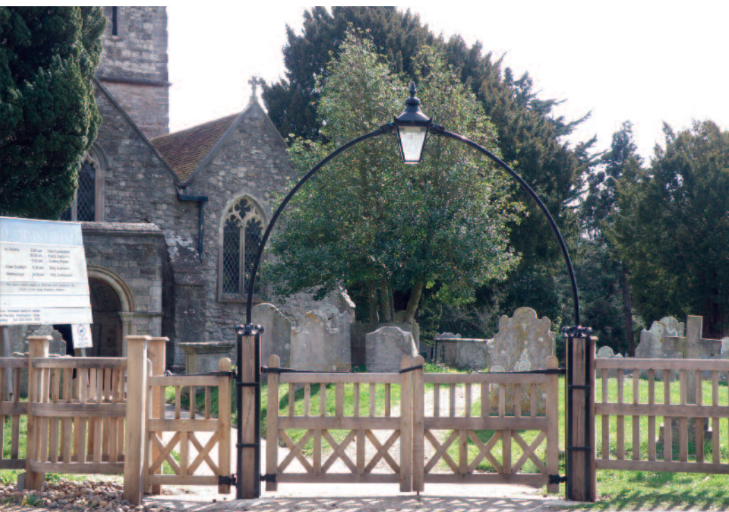
After - April 2010