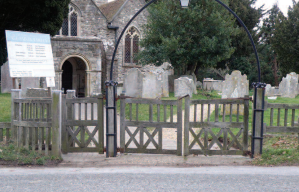
Before - November 2009